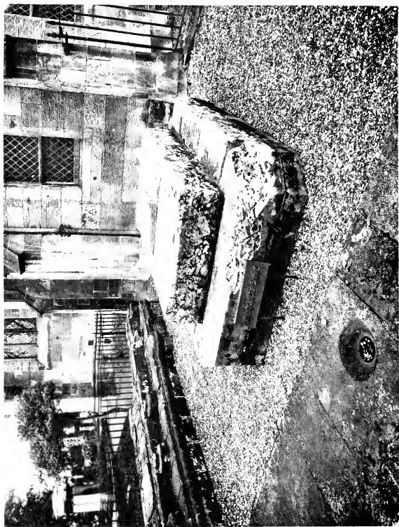
ST. MARGARET'S SHRINE